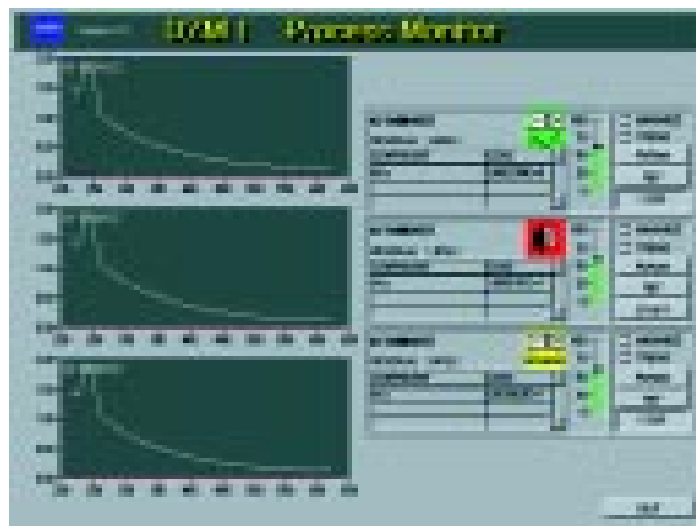
Figure 2: LabView screenshot